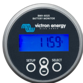
BMV 602S Black

No prescaler needed. Note: RJ45 connectors are galvanically isolated from Controller and shunt.