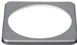
BMV bezel square