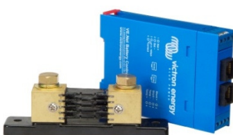
VE.Net Battery Controller